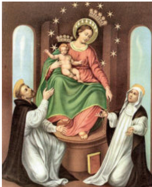
Our Lady of the Rosary, Pray for us!

Sunday Contributions..... $ 705.00 Needs of Canadian Church ..... $ 20.00